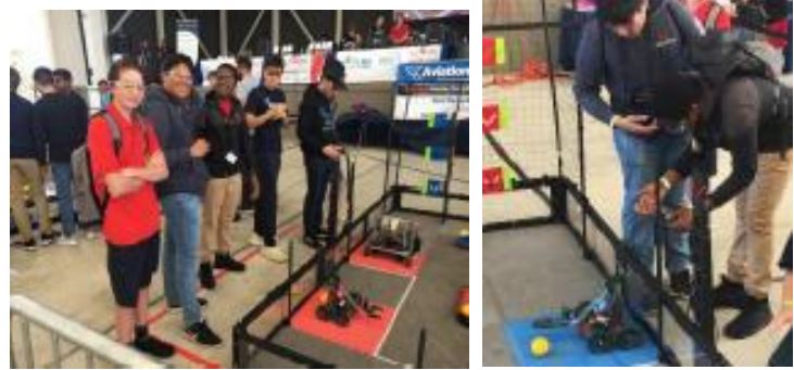
VEX Robotics Team In Action