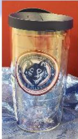
The 16 oz. sells for only $20.

Whether you have been longing for a great travel cup for your hot beverages during these "cold" days or a way to show your school spirit while staying hydrated, these custom Sheridan Tech tumblers fit the bill. Made by Tervis (a Florida company), each double-wall insulated tumbler is dishwasher safe and comes with a lifetime warranty.