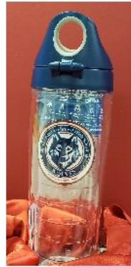
The water bottle is $24