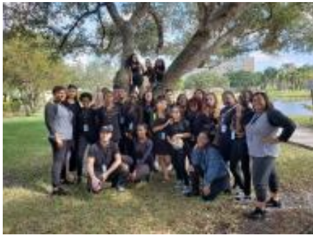
Drama Club Troupe 8356

High Fives also go out to our VEX Robotics team who competed in their first event last month and represented STHS well!