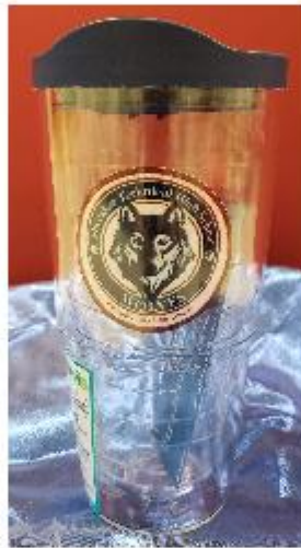
The 24 oz is $22